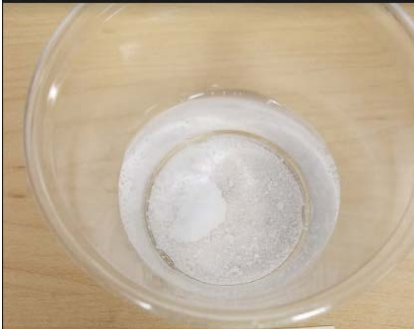
Fexofenadine Antihistamine Tablet 180mg after 8 hours