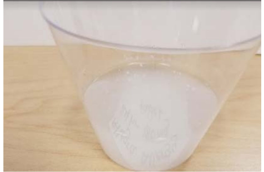
Fexofenadine Antihistamine Tablet 180mg after 24 hours