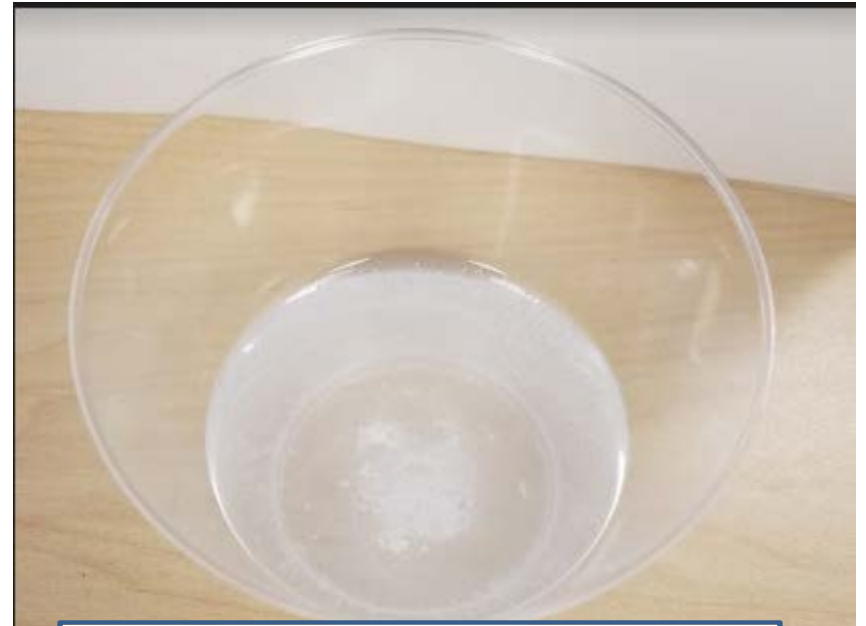
Beta Blocker Caplet 25mg after 24 hours