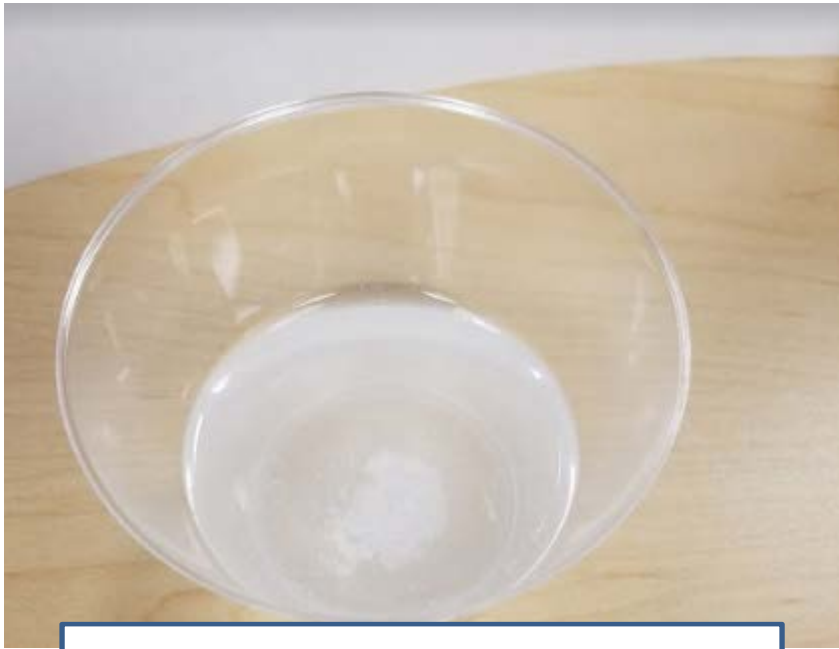
Beta Blocker Caplet 25mg after 8 hours