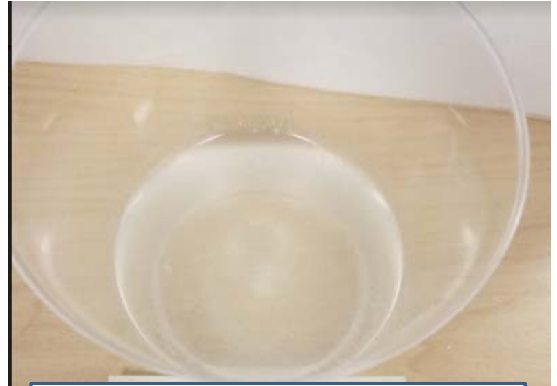
Cholesterol Lowering Tablet 20 mg after 24 hours