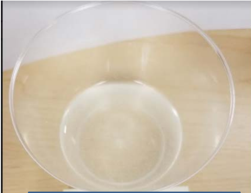
Cholesterol Lowering Tablet 20 mg after 8 hours